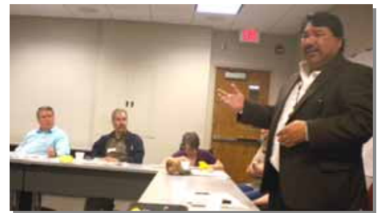
is first in the country and is historic at best."