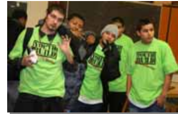
YouthBuild participants built and completed two homes as part of the 2009-2010 program